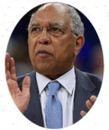
Tubby Smith Legendary Coach